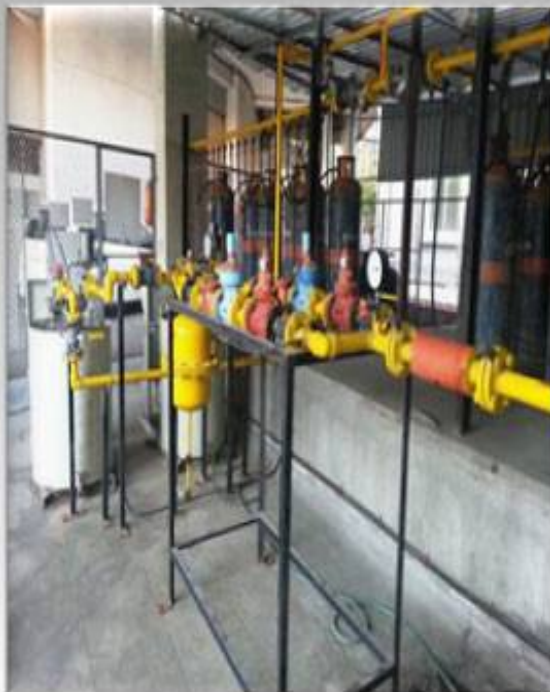
Industrial LPG Installations