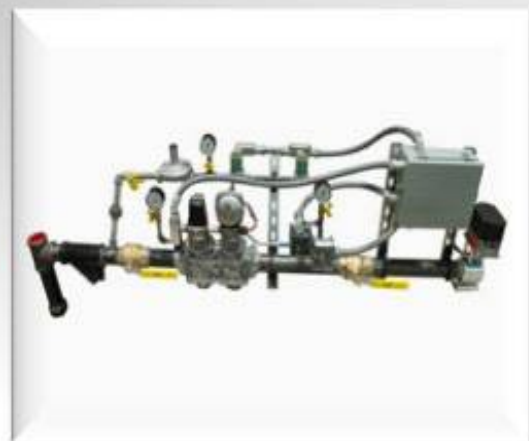
Gas Trains Installations