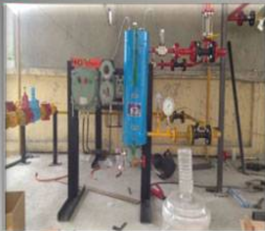
Multi Cylinder Installations (VOT & LOT)