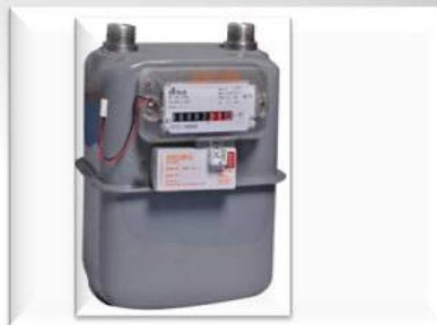
Gas Flow Meter Installations