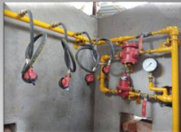
Commercial LPG Installations